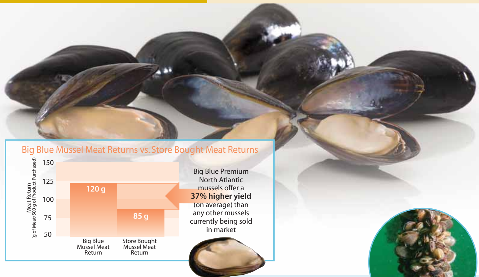
Big Blue Mussel Meat Returns vs. Store Bought Meat Returns

Coastal regions of the North Atlantic Ocean create ideal conditions for the growth of blue mussels. The cold, clear natural environment provides suspension-feeding mussels with a rich and abundant source of nourishment. That's why Big Blue Premium North Atlantic Mussels offer superior size, flavour and quality.